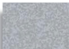
Bare Zinalume® Plus